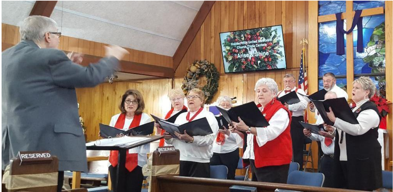
Holiday Hills United Methodist Church Choir Cantata—Rise & Shine