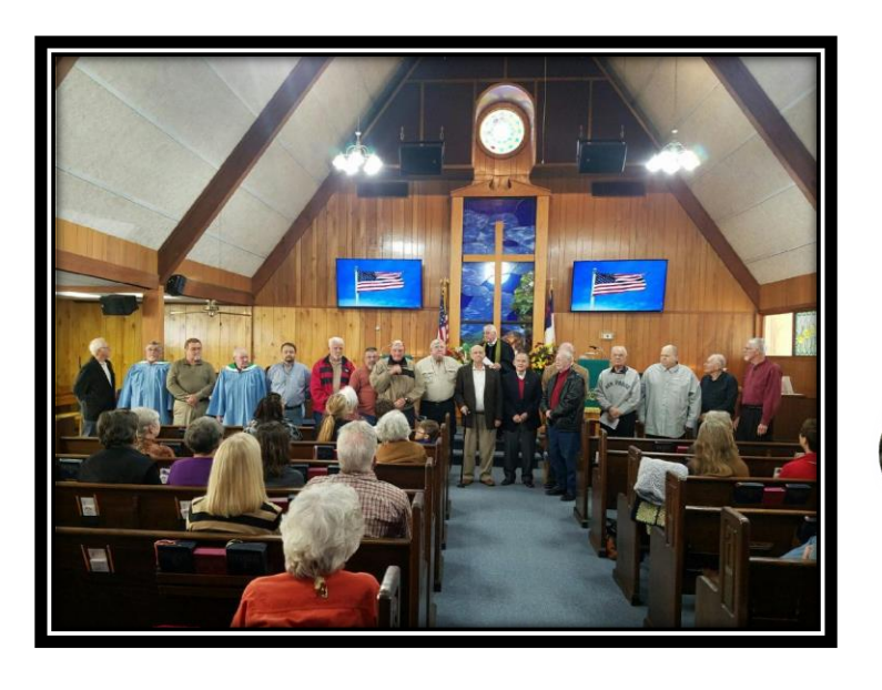
Honoring Our Veteran's